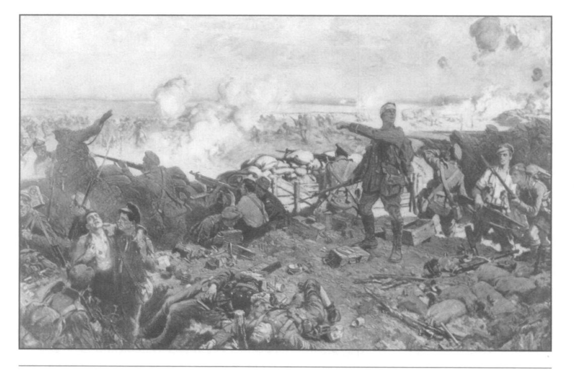
Material History Review 47 (Spring 1998) / Revue d'histoire de la culture matérielle 47 (printemps 1998)

On the morning of April 24 the battered Canadians were once again pounded by the German artillery and this time it was accompanied by the hissing of gas — the second chlorine gas attack of the war was directly against the Canadian lines. As the wall of gas drifted toward their trenches, officers and men, noticing the green tarnish to their buttons two